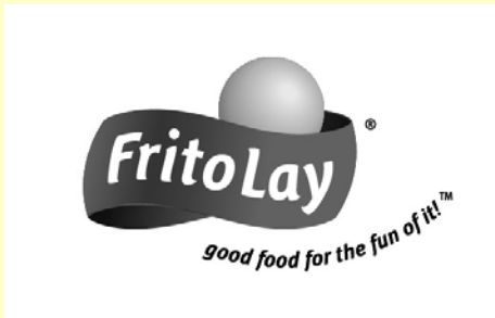
Frito Lay Job Opening

The Human Resources Manager, will serve as a business partner to the Site Leadership Team and reports to the VP of Human Resources and is responsible for the development and coaching of the HR team which includes a Human Resources Manager and Human Resources Coordinator. The HRM and Leadership team will work closely together to advocate for employees and partner with business teams to inspire greatness in our people, evolve the culture and drive sustainable business growth. Our Vancouver site produces approx 100 million pounds of Cheetos, Doritos, Fritos, Lays, Ruffles Santitas and Tostitos and has 550 employees.